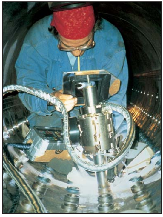
Model 81 in AVC/tilt version welding inside mud drum